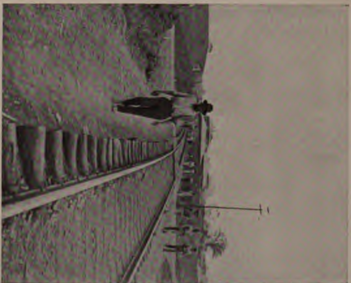
The End of the Noon Hour